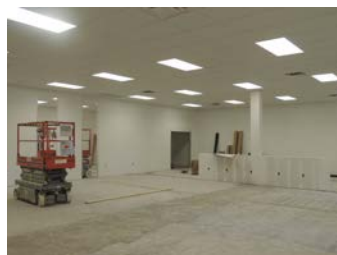
Walls are up, painting has begun and the locker rooms look fantastic!!