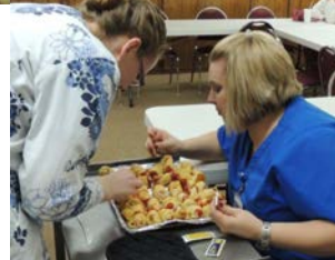
Mummy weenie wraps Yumm!