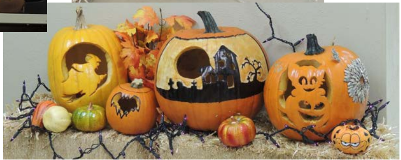
Halloween Themed Pot Luck